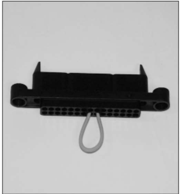
Figure 3. Zone Interlock Shorting Plug