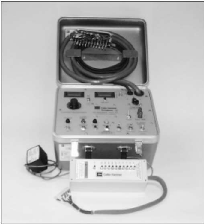
Figure 2. Test Kit and Adapter