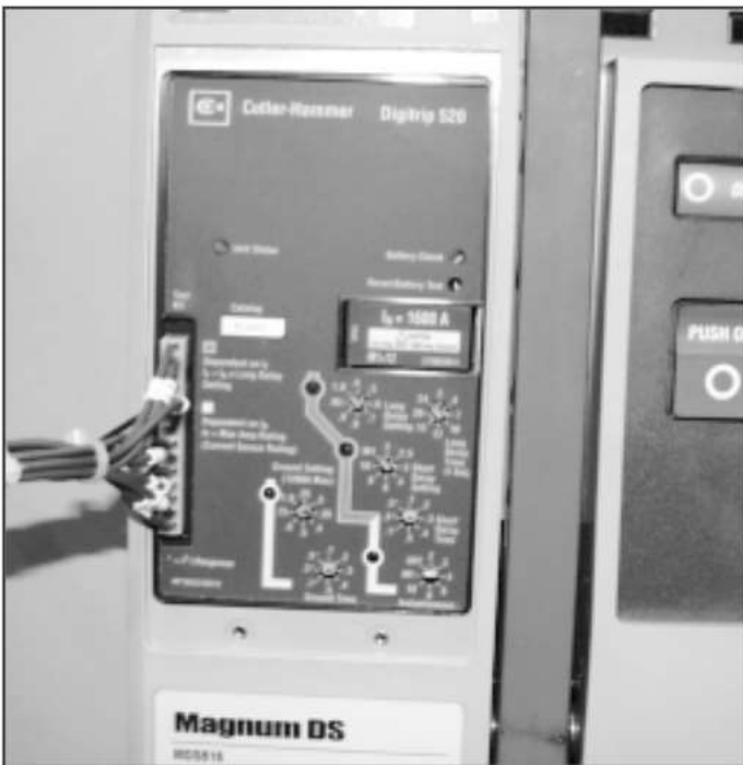
Figure 4. Trip Unit Face Plate Showing Test Port Connection